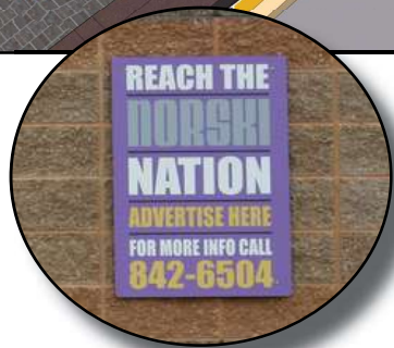
Custom Sponsor Sign